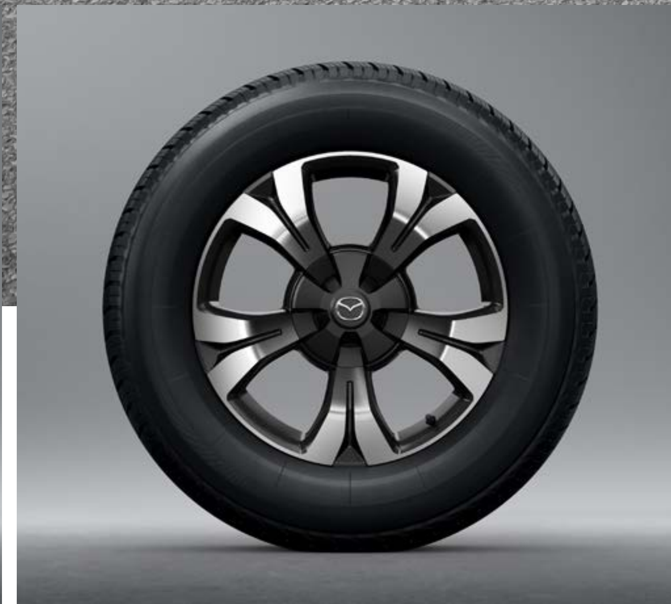
18-inch alloy on GTX and Limited models