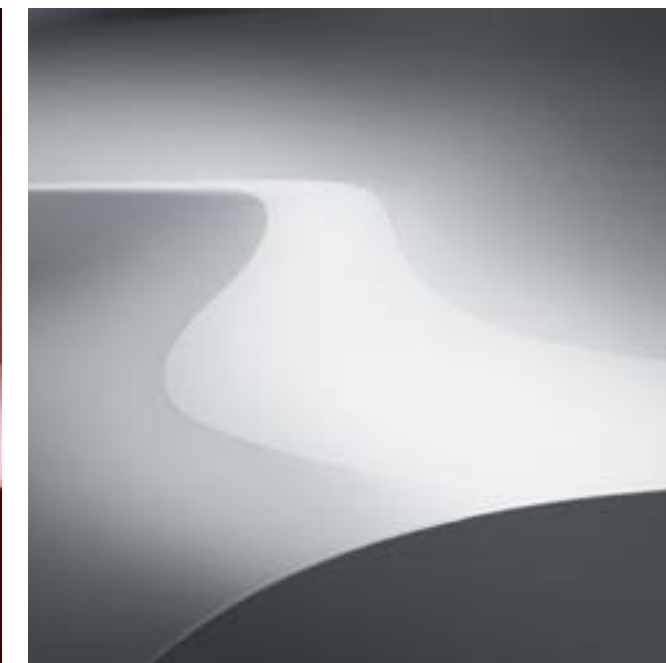
Ingot Silver Metallic