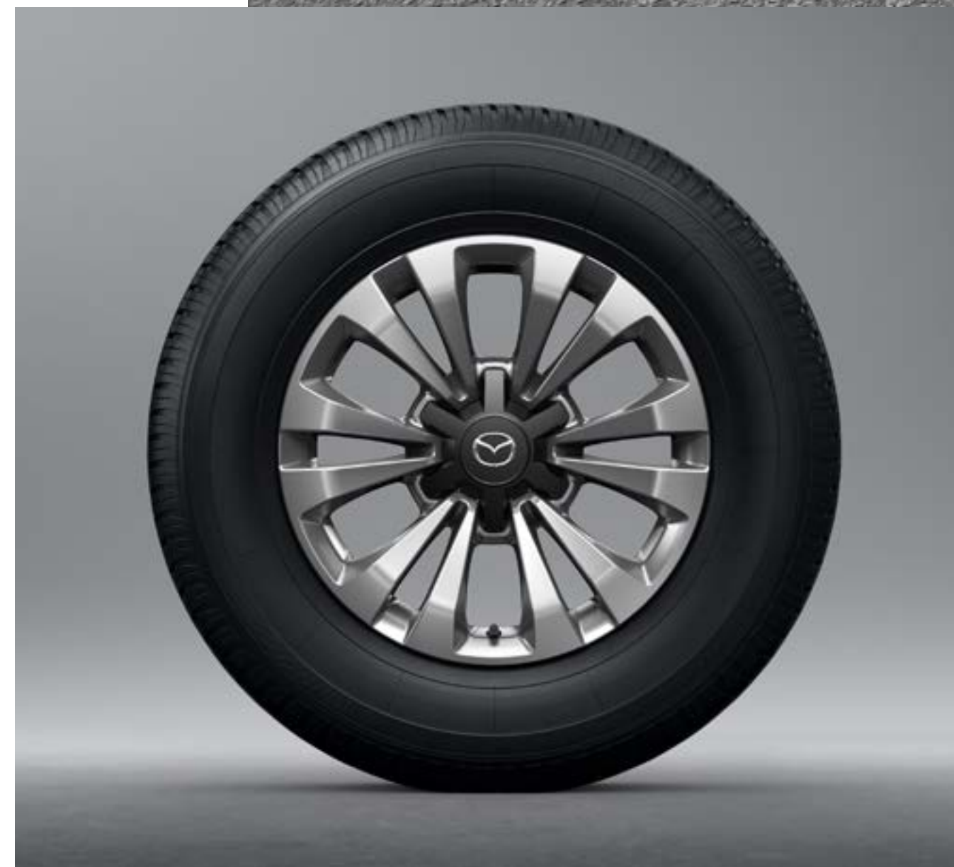
17-inch alloy on GSX models

Both 17-inch and 18-inch aluminium wheels are available to All-New Mazda BT-50. The 18-inch wheels take on a spoke design that delivers a sense of power and depth. The 17-inch wheels convey a feeling of sophistication and functional beauty. Both sizes employ a cap that meets the spokes in the centre of the wheel, adding to All-New Mazda BT-50's bold sense of style.