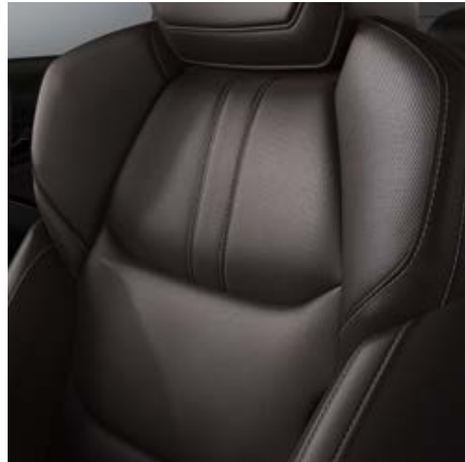
Brown Leather# (Limited)