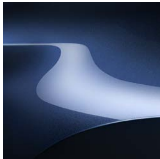
Gun Blue Mica