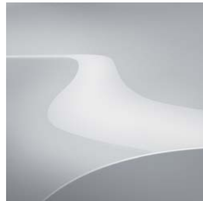
Ice White Solid