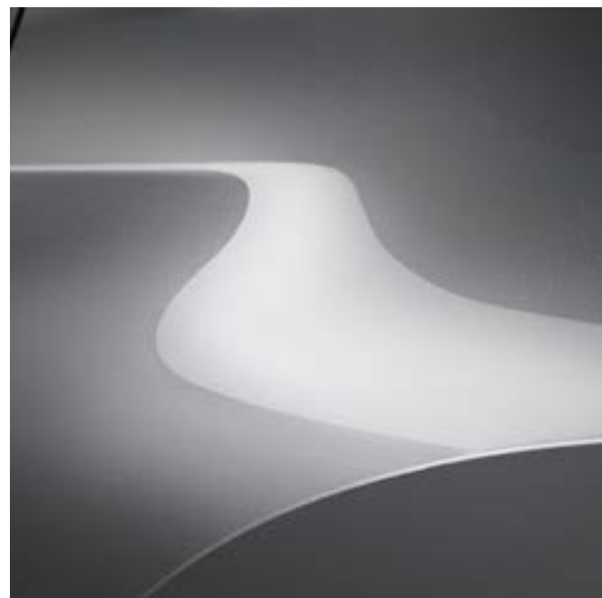
Concrete Grey Mica