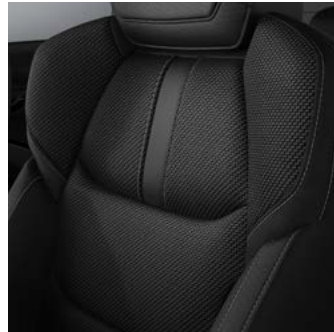
Black Cloth (GSX and GTX)