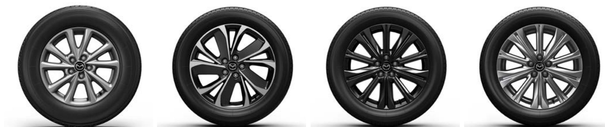
17-inch alloy wheel Silver (GLX & GSX)