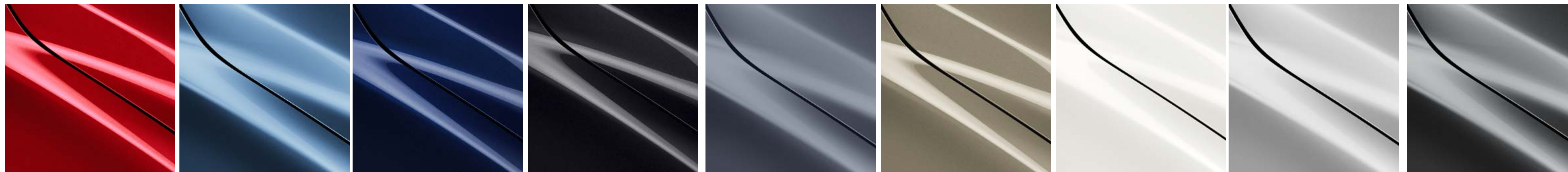
Soul Red Crystal Metallic^