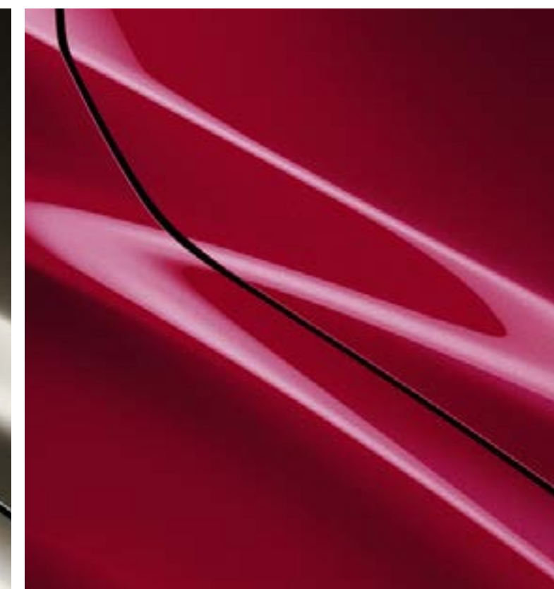
Soul Red Crystal Metallic ^