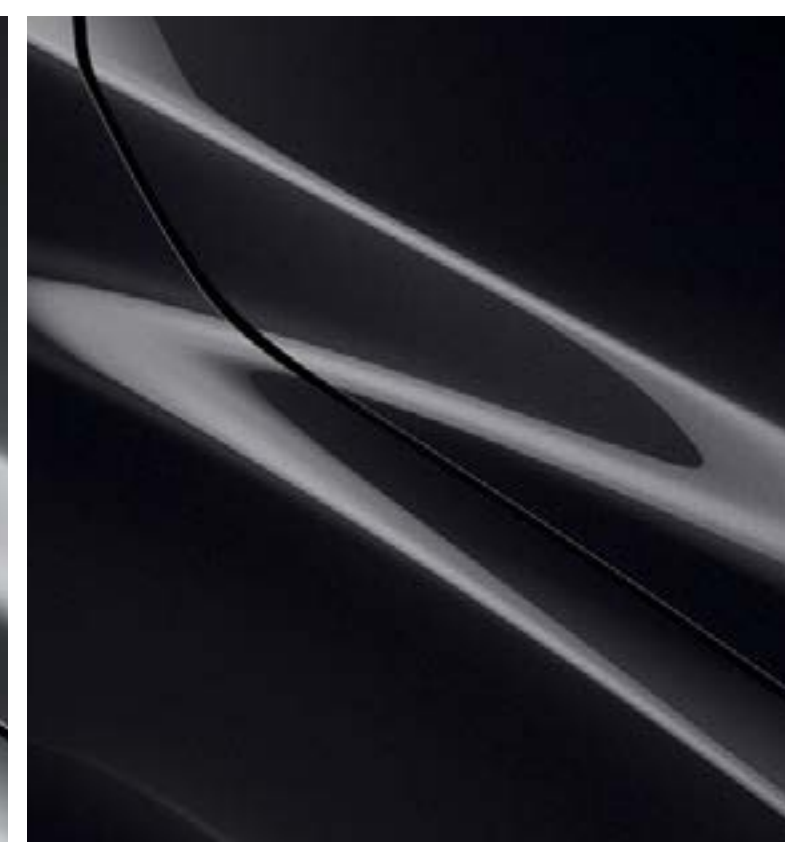
Jet Black Mica