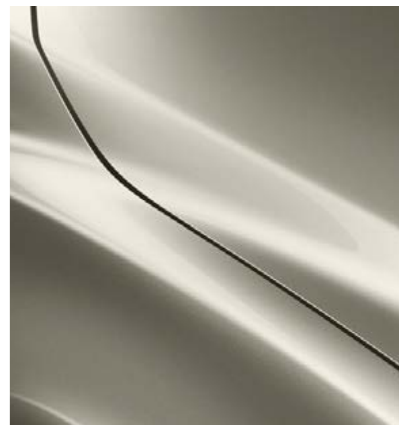
Platinum Quartz Metallic