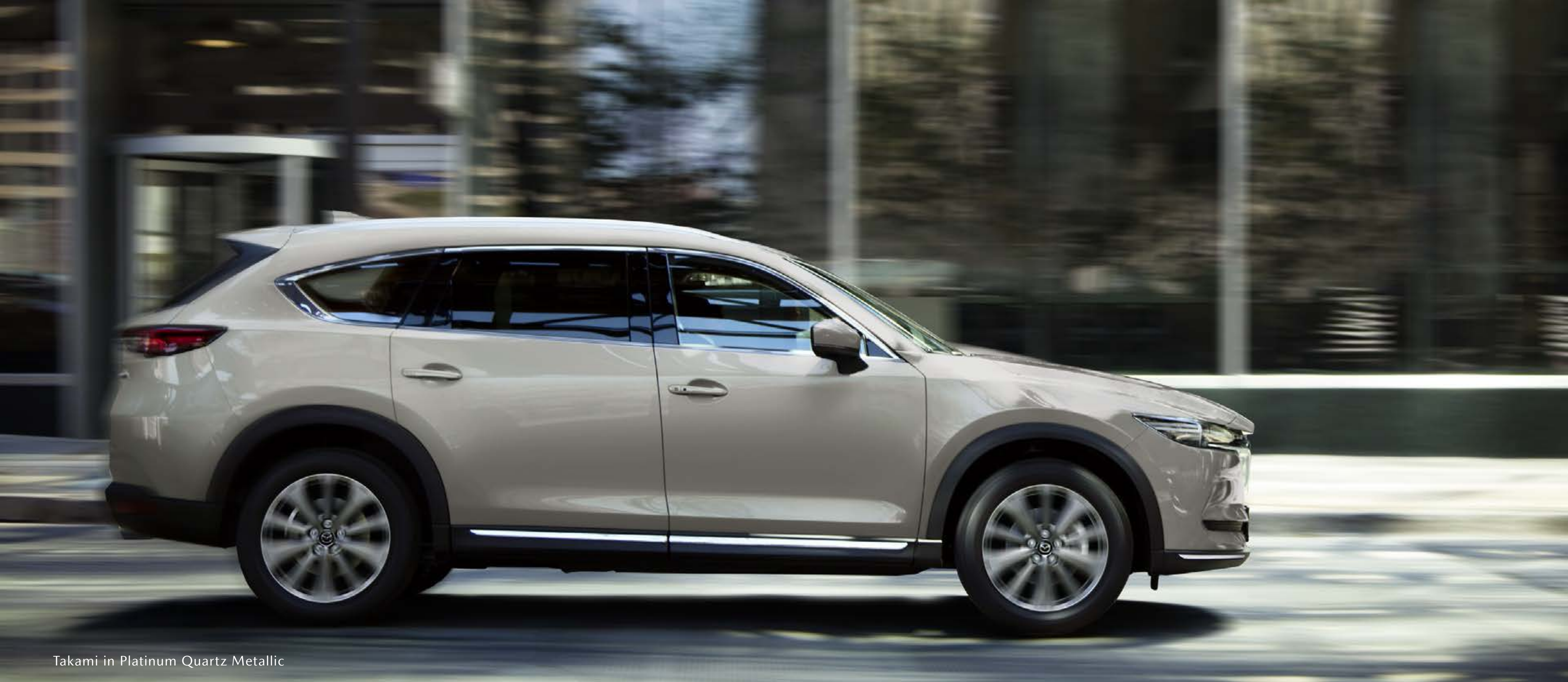
Takami in Platinum Quartz Metallic

THRILLING PERFORMANCE. IMPRESSIVE EFFICIENCY.