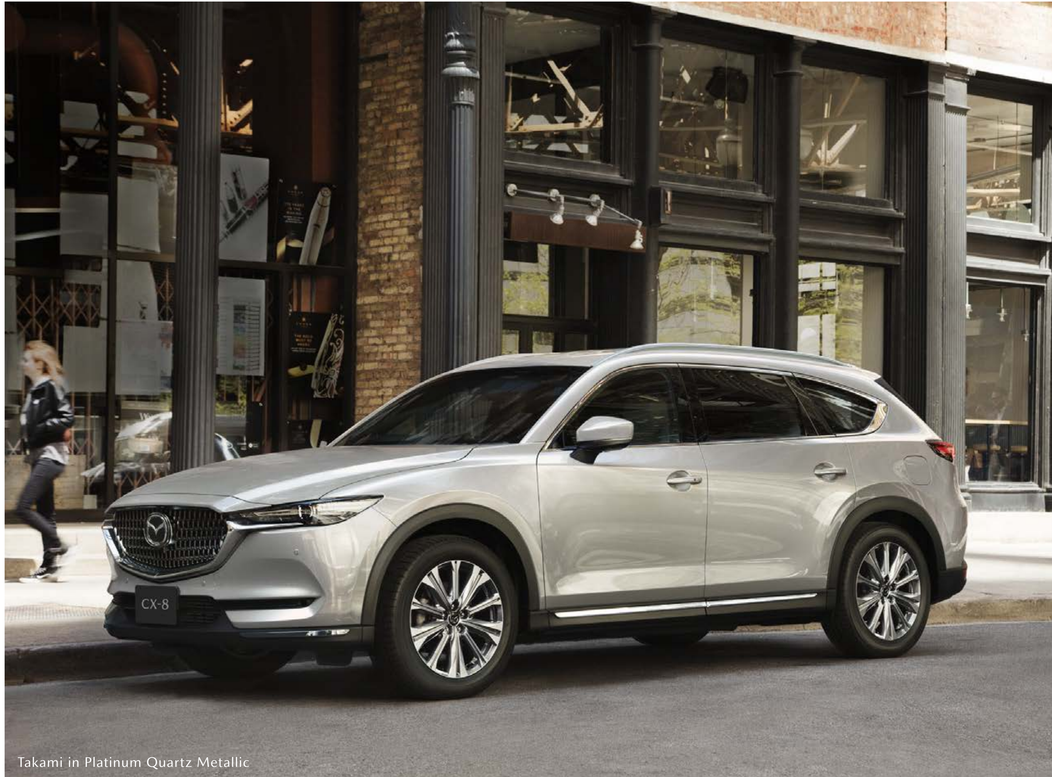
Takami in Platinum Quartz Metallic