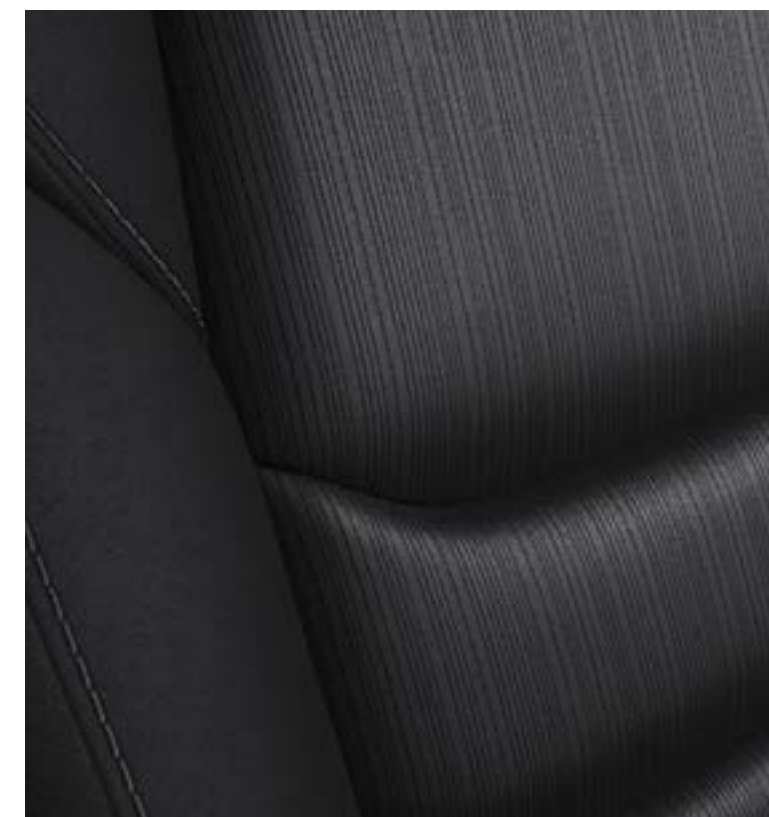
Black Cloth (GSX)

Luxurious materials maintain the feeling of considered design throughout the cabin, from the seats to the door trims and centre dashboard. Beautiful to touch and to admire, these trims create a stylish, fresh ambience that speaks to Mazda CX-8's modern styling.