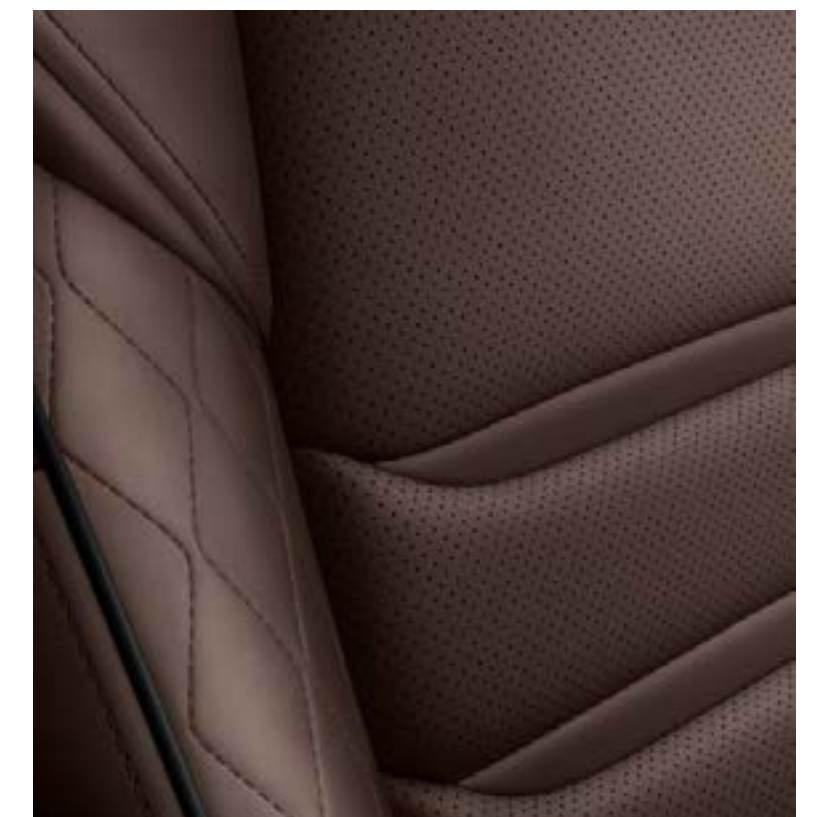
Chroma Brown Nappa Leather# (Takami)