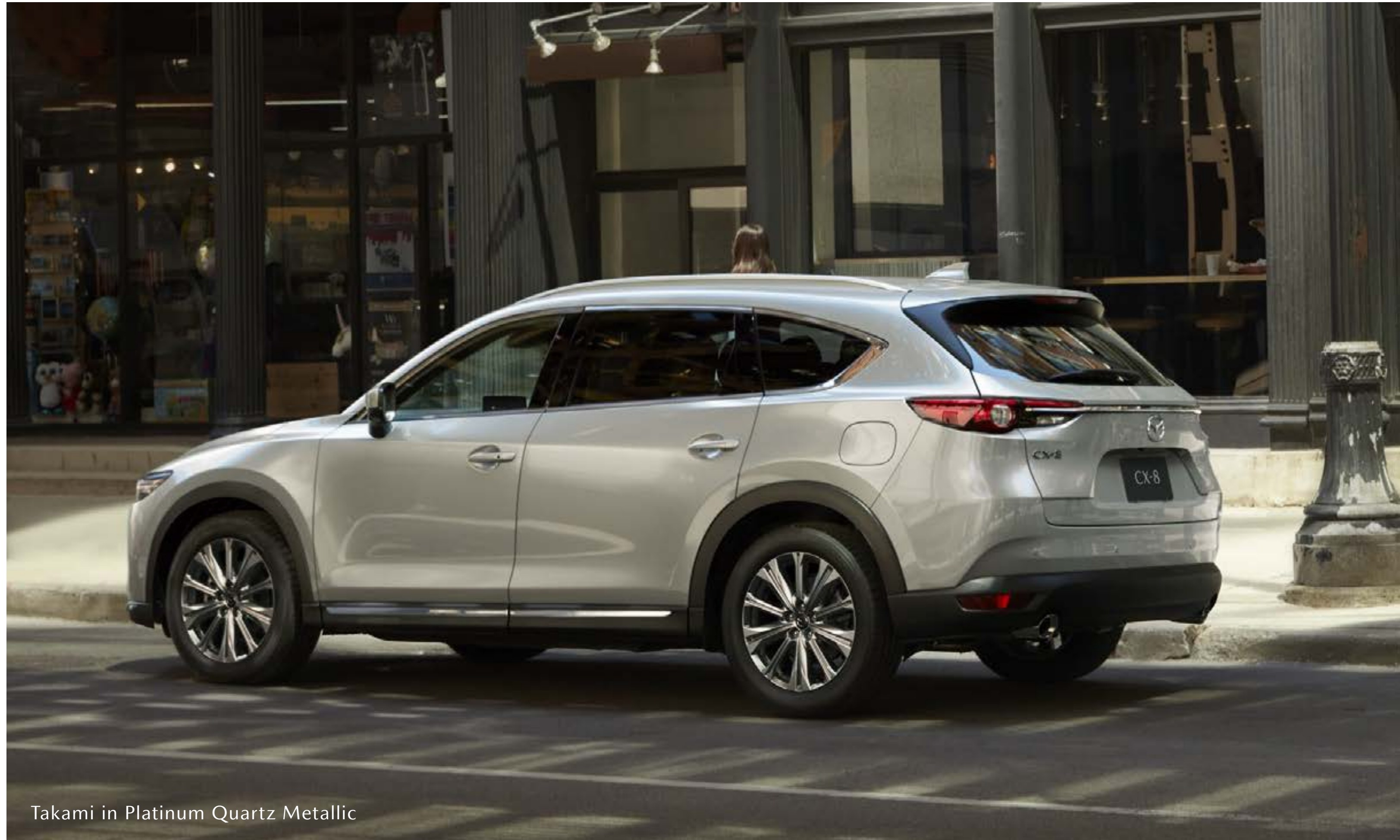
Takami in Platinum Quartz Metallic