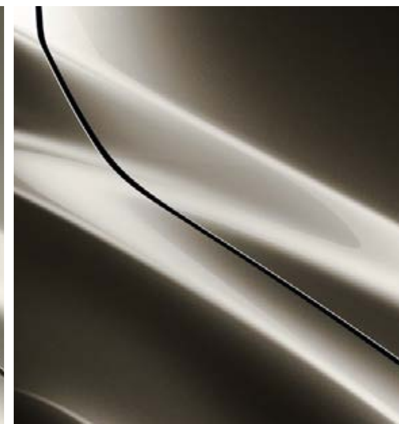
Titanium Flash Mica