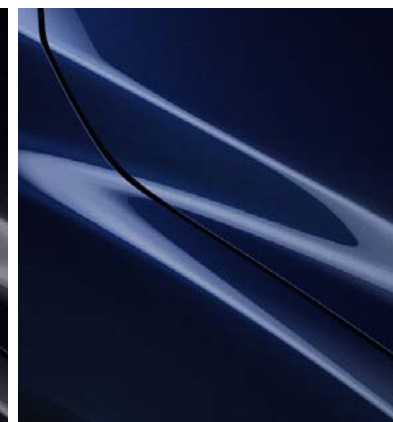
Deep Crystal Blue Mica