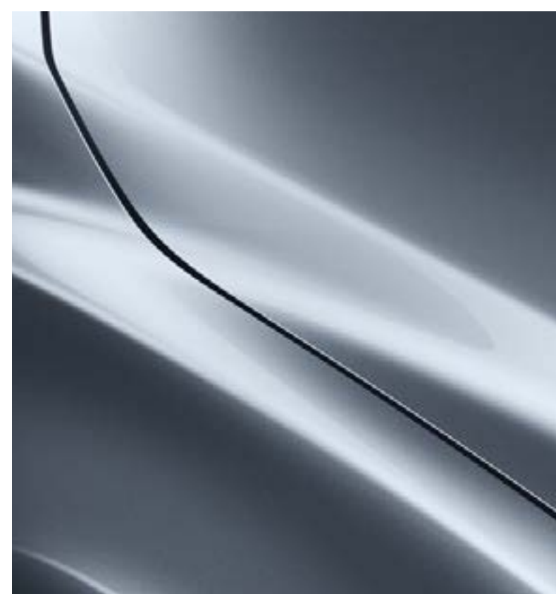
Polymetal Grey Metallic