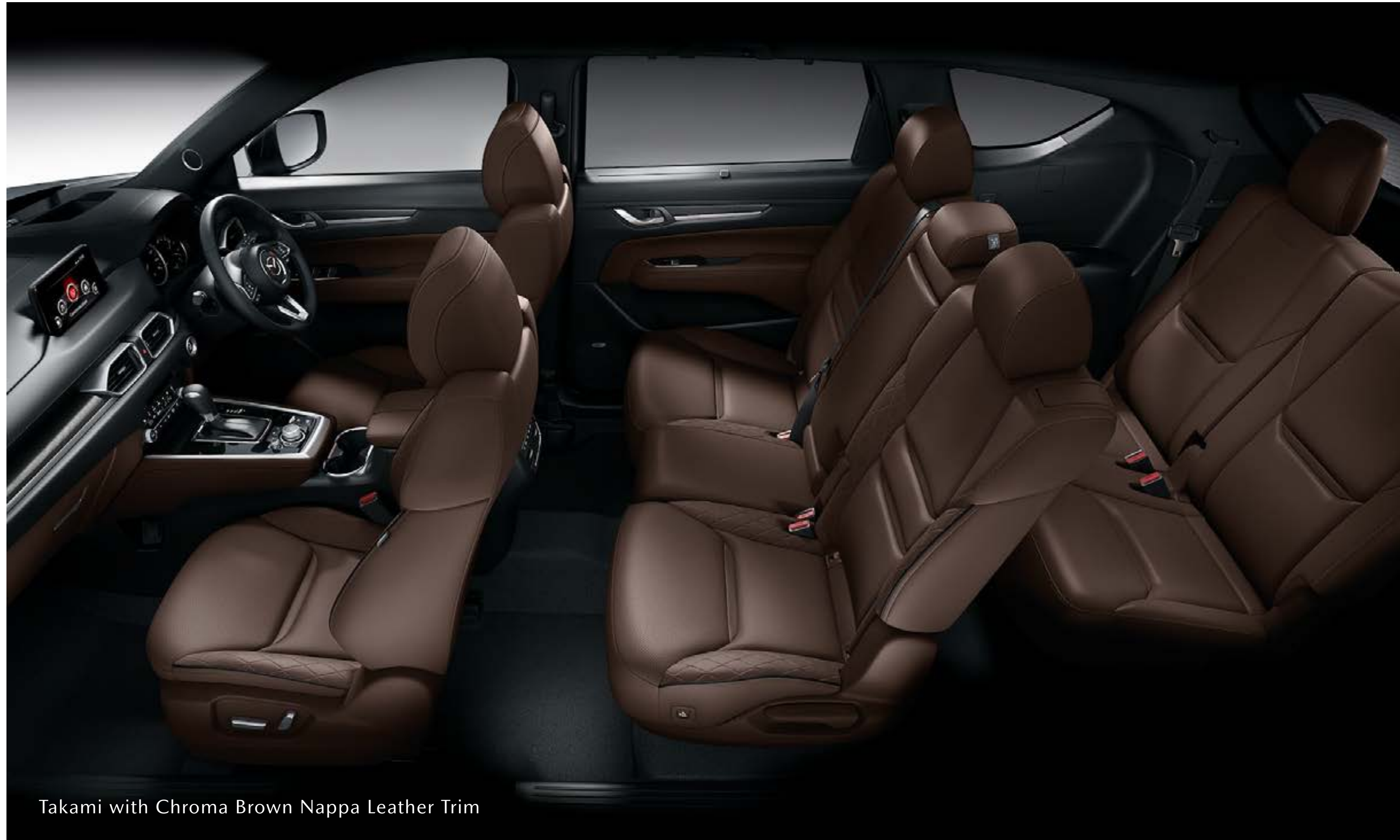
Takami with Chroma Brown Nappa Leather Trim