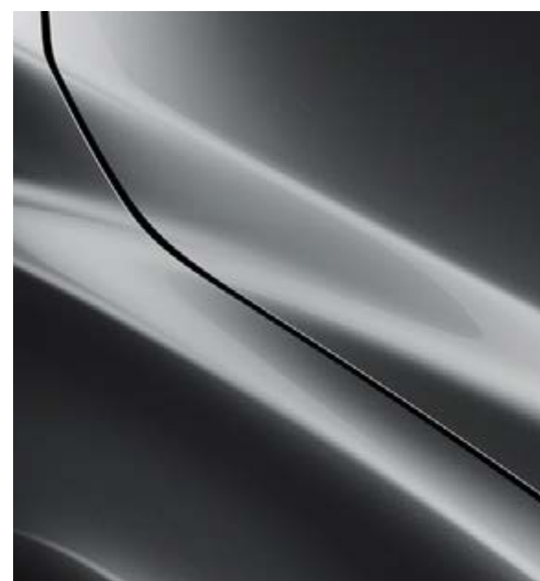
Machine Grey Metallic ^