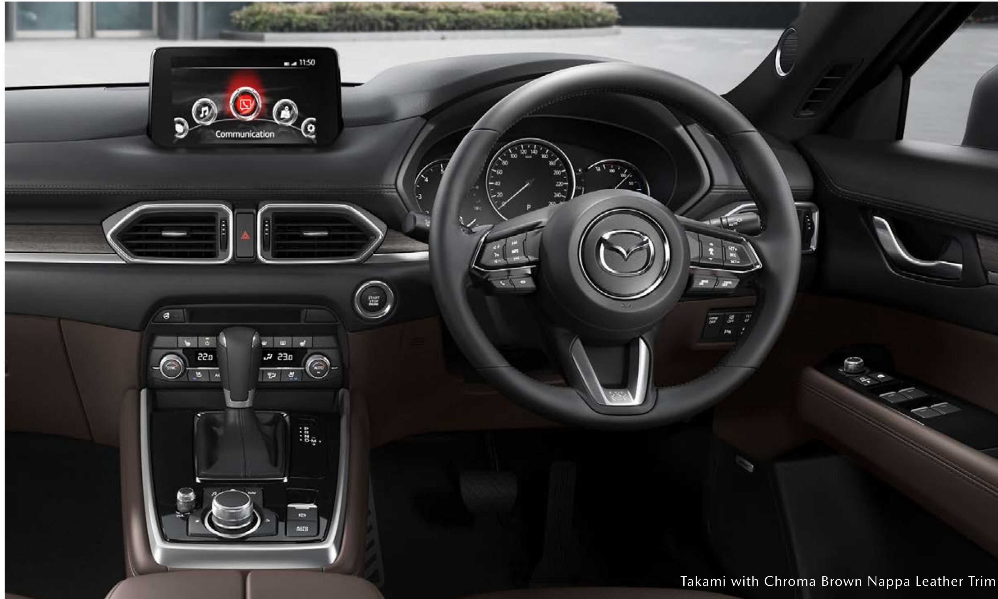
Takami with Chroma Brown Nappa Leather Trim