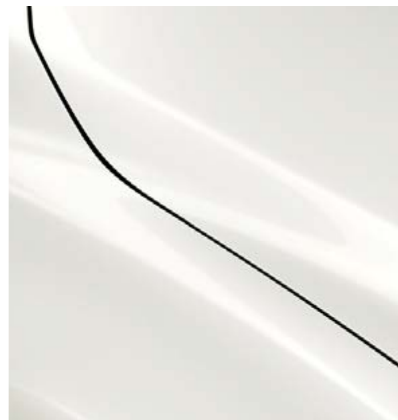
Snowflake White Pearl Mica